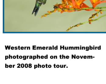
Western Emerald Hummingbird photographed on the November 2008 photo tour.

Use the camera's timer or a cable release to eliminate camera shake. Keep the ISO at 100 or 200 to eliminate graininess